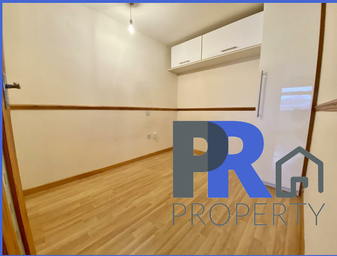
36, Burfield Court Handcross Road, Luton, Bedfordshire, LU2 8JY £850 PCM